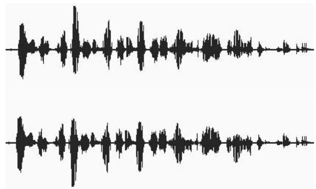
Figure 2: Speech waveforms before (top) and after (down) the polarity inversion.

A typical syllable consists of a vowel nucleus, and at the onset and the coda, the power of the waveform is usually small, and it satisfies the condition 1), above. The syllable